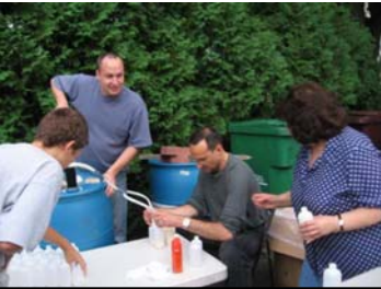
Soap Production Donated by Zsa Zsa