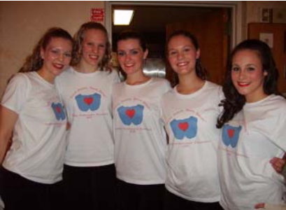
Step by Step Dance Co. Holiday Recital