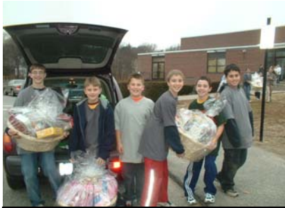
KIDS HELPING KIDS, AUBURN MIDDLE SCHOOL