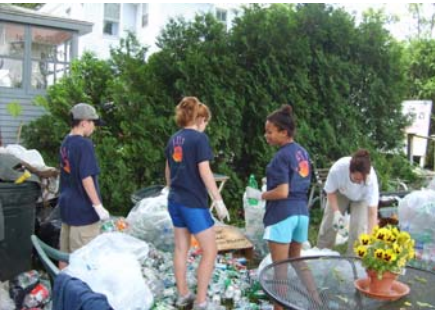
CAN DRIVE SORTING