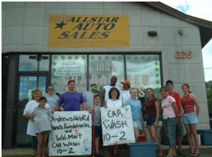
ALL STAR AUTO CAR WASH