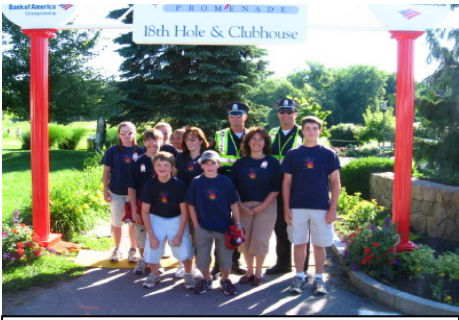
PGA CHAMPIONSHIP TOUR