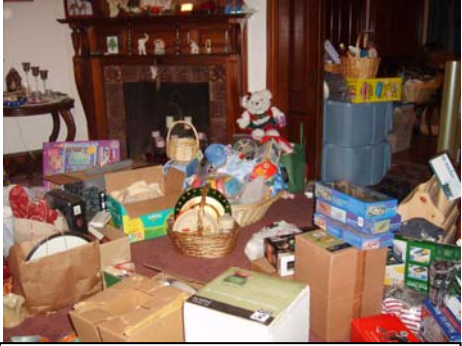
GET READY TO MAKE BASKETS